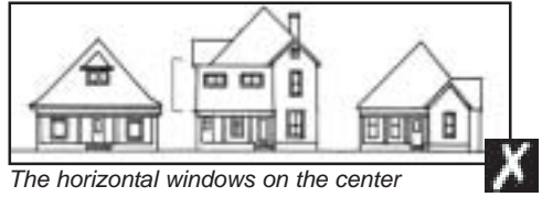
The horizontal windows on the center structure are inconsistent with the vertical window proportions of its neighborhood context.