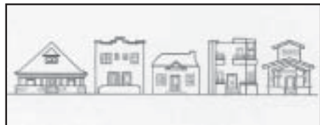
A traditional streetscape composed of a variety of windows and doorways all orientated to the front of the building.