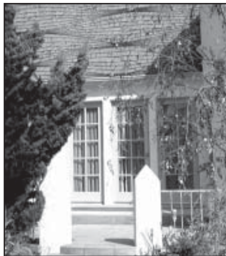
English Revival French doors