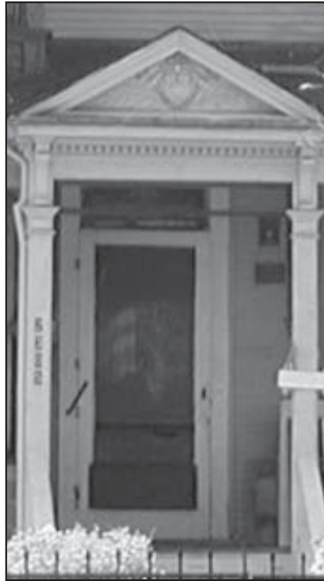
Queen Anne style entry porch