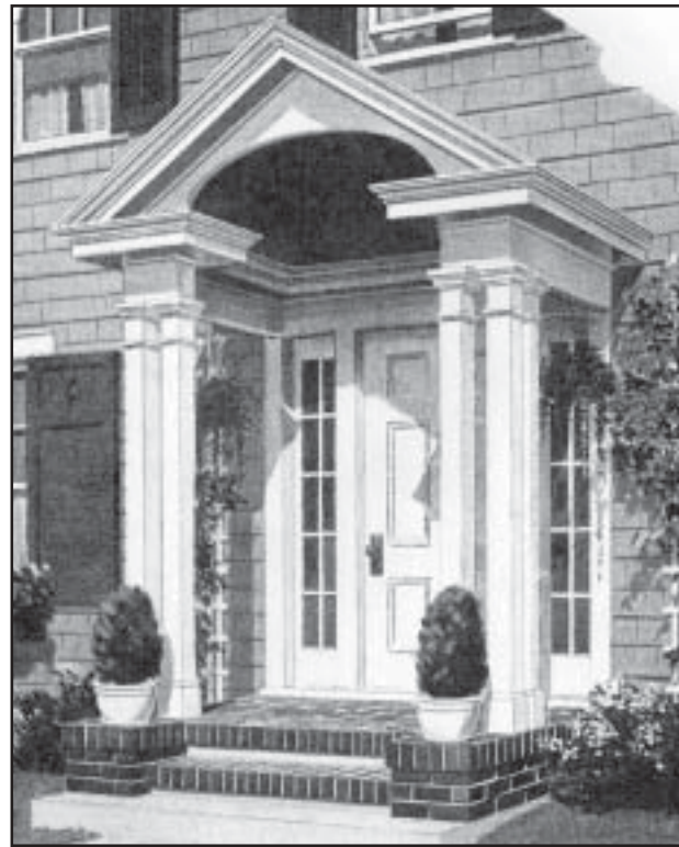
Colonial Revival entryway