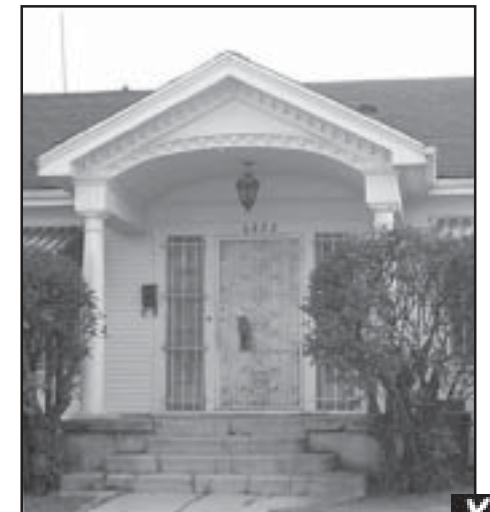
Security doors and bars disfigure this entryway.