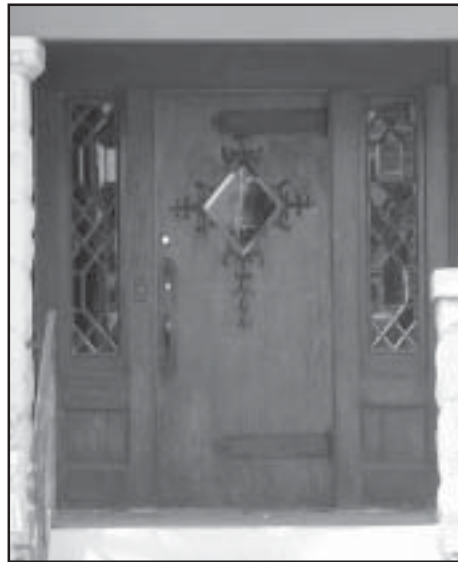
Loss of this door and its sidelights would have a negative effect on the character of this house.