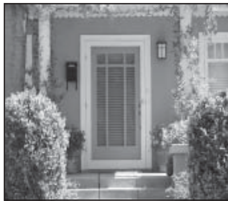
Typical entryway with screen door.